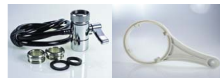
Faucet Adapter Kit